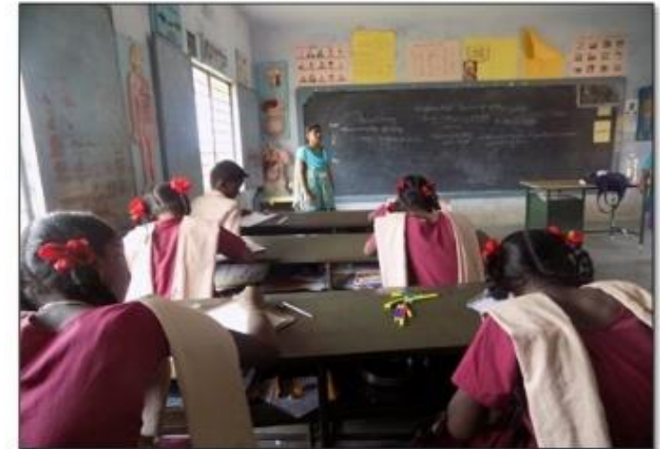
Competition conducted for school students