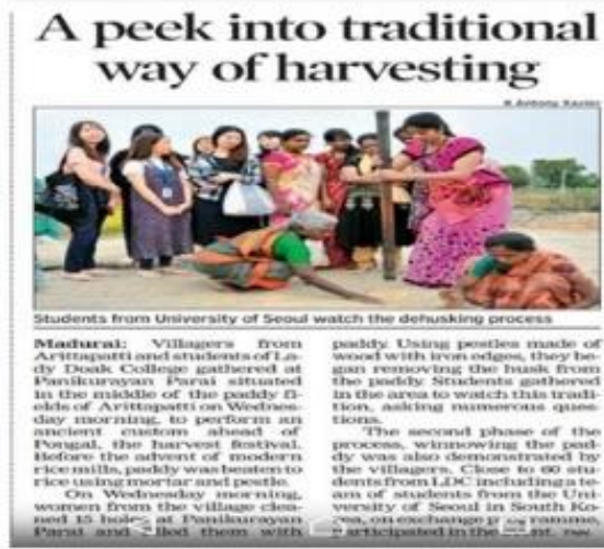
Students' participation in traditional way of harvesting at Arittapatti