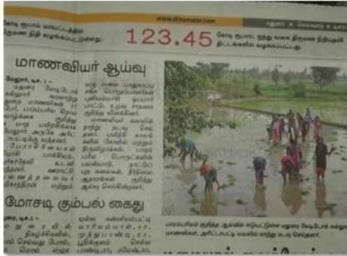
Students' participation in farming at Arittapatti