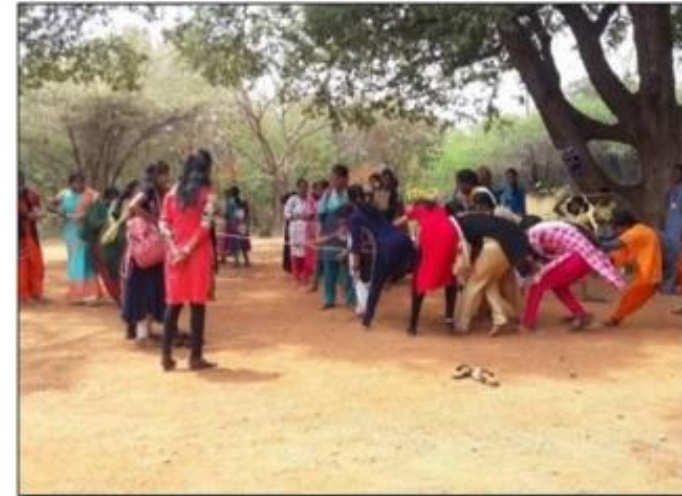
Participation of students and community - Traditional games